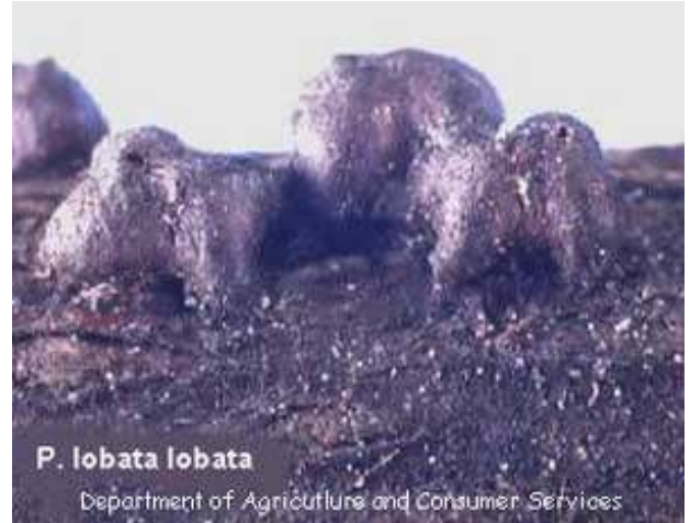
Note the unique shape of this scale.

http://creatures.ifas.ufl.edu/orn/scales/lobate_lac.htm