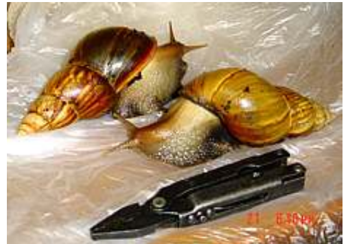
Giant African Land Snails